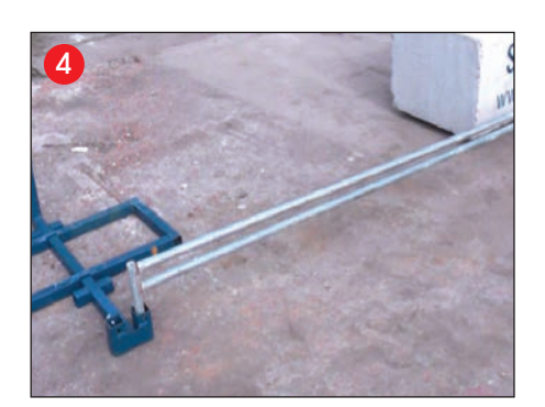
Repeat 1 and 2 using the Spacing Tool to ensure correct distance.