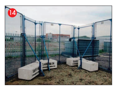
90 degree and 135 degree Corner Panels.