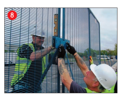
While assistants hold panels vertical, fit 4no. M8x70 Coach Bolts through Front Clamp Plate, Panel Mesh and Brace Plate using Nyloc Nuts and M8x50 Washers behind.