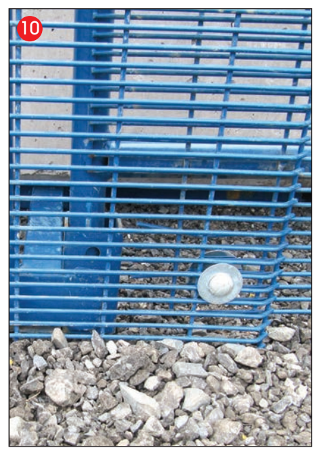
Bottom Cover Mesh bolt to be no more than 50mm from ground.