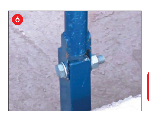
Connect Brace to Base using M16 Hex Bolt and Washers.