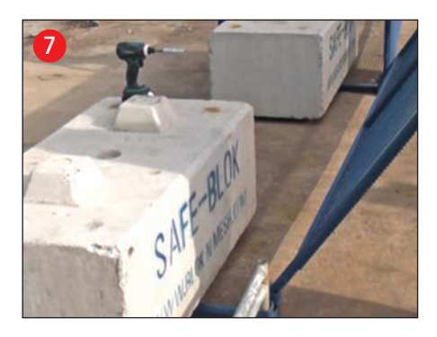
Insert Panels into Base. Manual lifting Note: Each Panel weighs 98kgs.