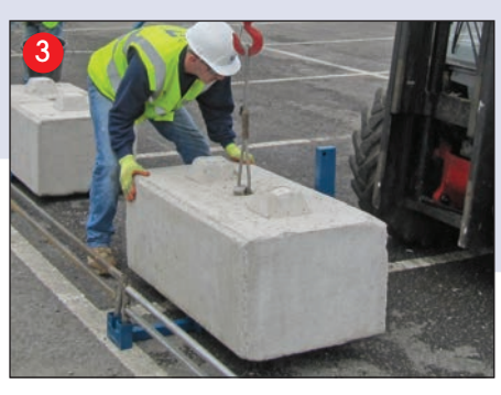
Place Ballast Block onto Base and Loading Tray (Not more than 50mm from backstop).