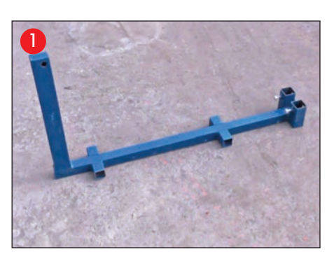
Position Base on Ground.