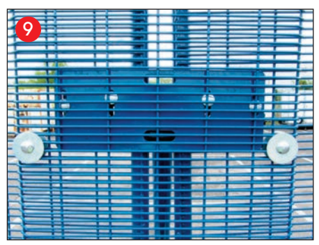
Attach Cover Mesh over Clamp Plate and Panel gap using M8x50 Coach Bolts with M12x50 washers (attack side), M8 Full Nuts and M8x50 washers (inside).