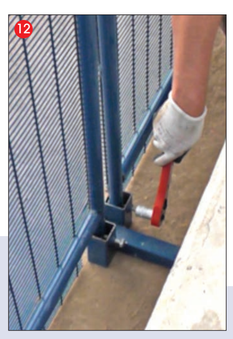
Tighten M10 captured bolt securely against Panel leg to prevent lifting. (Recommended Torque: 22N m, 16.2ft lb)