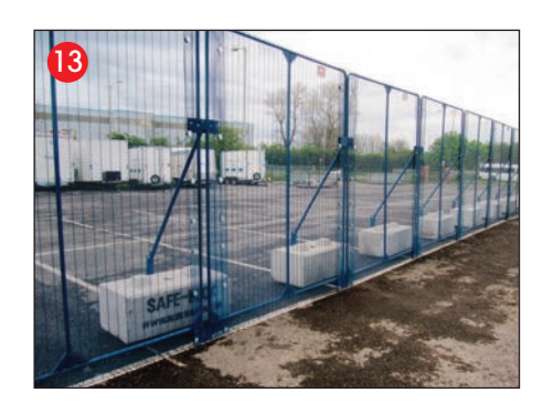
Repeat until Fence line is complete.