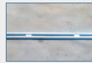
Double Welded Tube