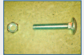
Nut and Bolt