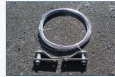
Tensioner and Tie Wire