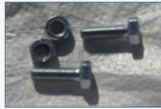
Nuts and Bolts