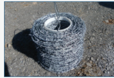
Barbed Wire Roll