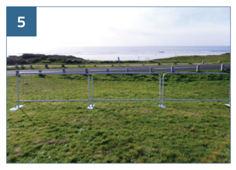
Measure the correct distance and place the next metal foot in position.

Blok 'N' Mesh Global Ltd and Blok 'N' Mesh Europe Ltd are not liable for any 3rd party installations. This installation guide is a guide only. Blok 'N' Mesh Global Ltd and Blok 'N' Mesh Europe Ltd strongly recommends that a full risk assessment and method statement should be carried out prior to installation.