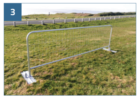
Insert barrier into feet as shown.