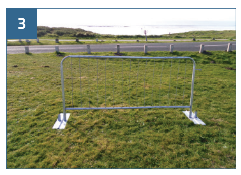
Insert barrier into feet as shown.