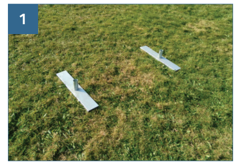
When you reach the desired location of the crossing point, measure the required distance and place two single metal feet in position.