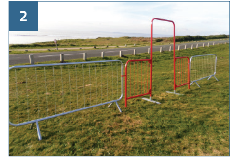
Insert the crossing point and attach hook to the barrier and continue with installation.