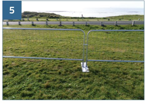
Connect barriers using a coupler as shown and tighten (recommended Torque : 7N/M )