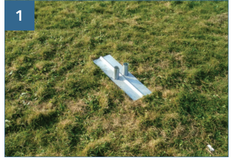
Place first double metal foot at the start of the intended line of installation.