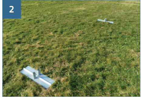
Measure the correct distance and place the next metal foot in position.