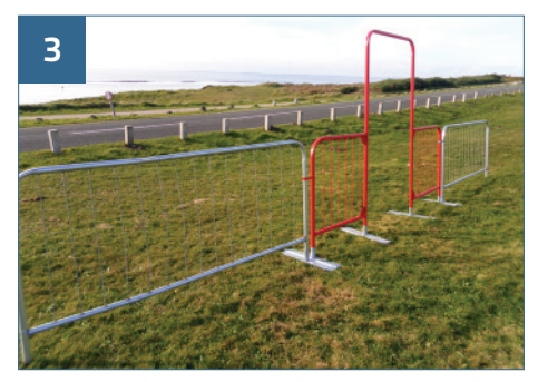
Crossing points can be used with any of the barriers in this guide.