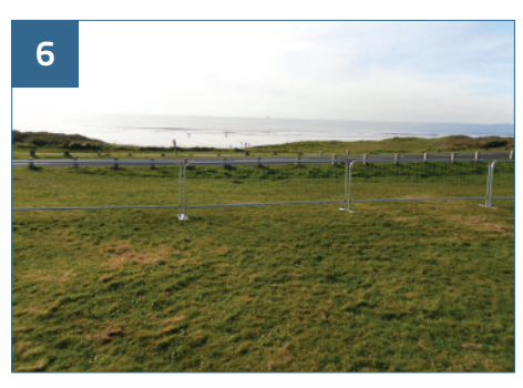
Repeat steps 4 and 5 until the installation is completed.