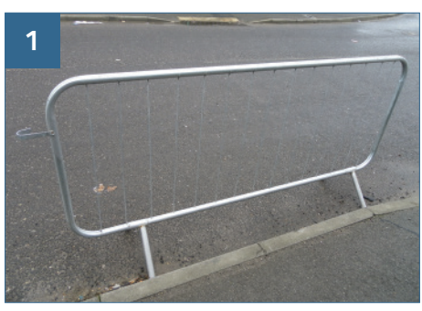
Place first barrier at starting point of intended line of installation.