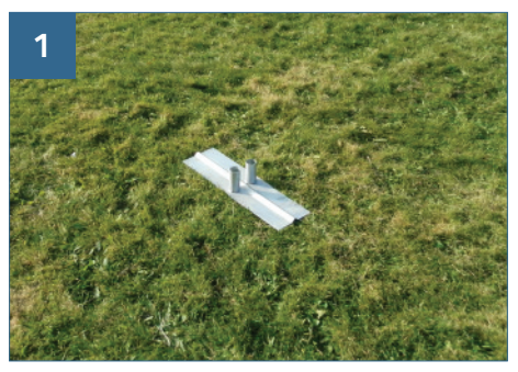
Place first double metal foot at the start of the intended line of installation.