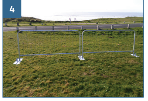
Place next foot in place and insert barrier, ensuring to connect to previous barrier using hook.