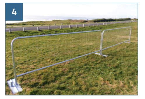
Place next metal foot at the re-quired distance from the previous foot and insert barrier.