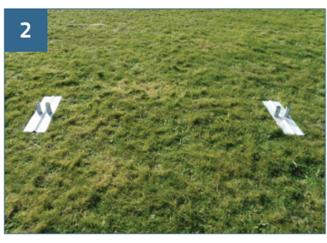
Measure the correct distance and place the next metal foot in position.