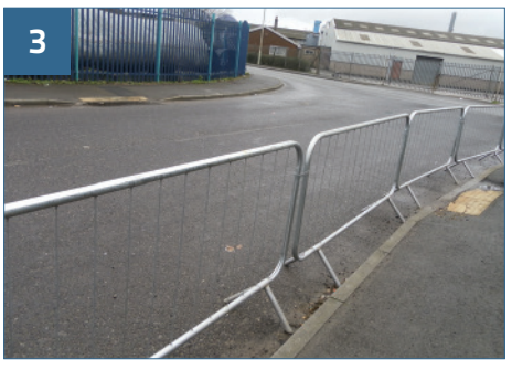
Connect the next barrier using the attached hook and pull tight.

Repeat until installation line is complete.